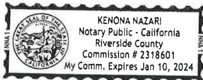
Place Notary Seal Above

Signature [Handwritten Signature] Signature of Notary Public